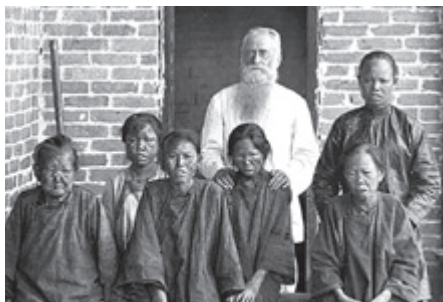
Missionary with leprosy patients

The world we live in is calling for Christians to point the right way. The world needs us to seek the lost for the Lord Jesus. We can respond to this call by dedicating ourselves to care for others and having as our sole purpose in life to glorify Christ. ■